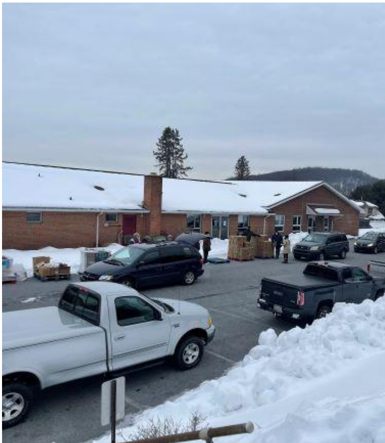
Food pantry distribution on 3rd Tuesday of each month