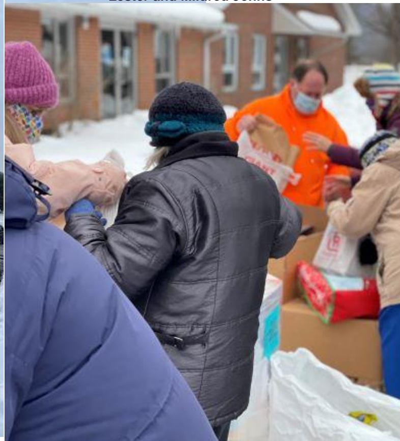
Serving over 100 families