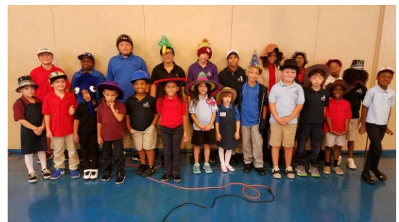
RJA students wearing various hats to school.

So what is the recommended amount sleep for school-aged children? According to the American Academy of Pediatrics, children of 3-5 years in age should receive 10-13 hours of sleep each day. 6-12 year olds should have between 9-12 hours each day, and 13-18 year olds should have between 8-10 hours per day. Are your children getting the recommended amount of sleep each day? As parents we want our children to be at their best. Help them by making sure your children are getting the rest they need!